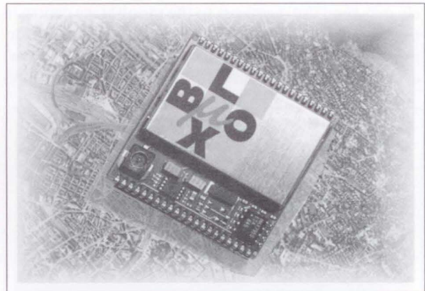
Figure 2 - Navigation receiver GPS-MS1E made at the Swiss company \mu -blox dimension 30 x 30 mm [11].

In the area of transport and logistics, the intelligent GPS receiver has opened new areas and new ways of using the means of information.