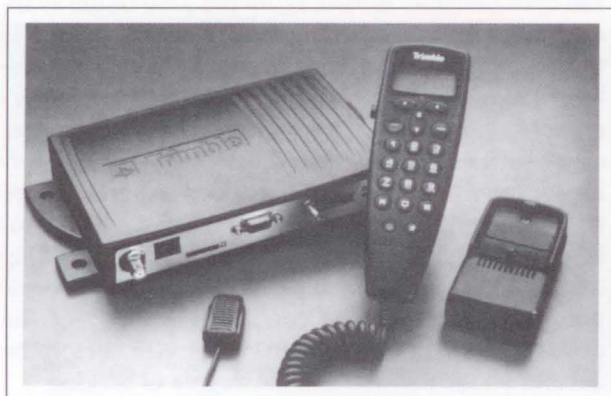
Figure 1 - The CrossCheck GSM equipment of the American producer Trimble Navigation [5].

Truck and load remote monitoring enables also prediction of engine troubles and breakdowns. This is particularly important when perishables or dangerous loads are transported. When the supervisor in the monitoring centre knows the position of the vehicle, he can choose, in advance, the suitable place for safe parking of the truck. The driver may try to repair a damage there by himself, or he could wait for help.