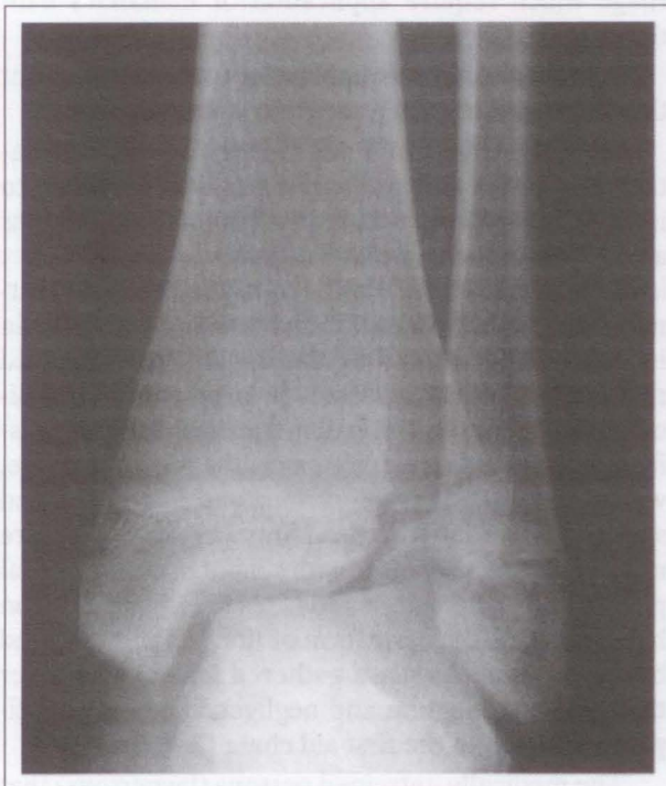
Figure 2 - Fracture of the external part of the tibia and the ankle joint

for the exam in first aid. The curriculum provides also the training in the basic principles of administering first aid in the form of immobilisation of the injured part of the body. The analysis of the gathered data has resulted in a disappointing fact about the poor quality of administering first aid by the laypersons, including the ignorance and failure of engagement in cases when the transport immobilisation is of extreme importance.