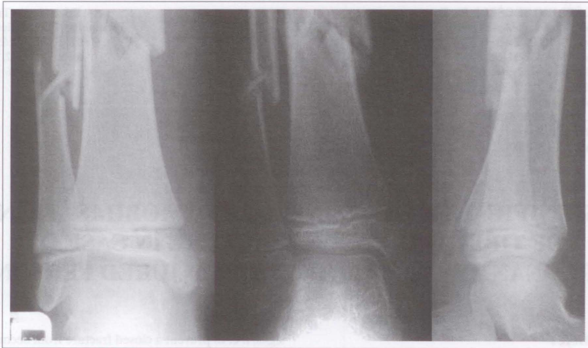
Figure 1 - Fracture of both lower-leg bones

for the exam in first aid. The curriculum provides also the training in the basic principles of administering first aid in the form of immobilisation of the injured part of the body. The analysis of the gathered data has resulted in a disappointing fact about the poor quality of administering first aid by the laypersons, including the ignorance and failure of engagement in cases when the transport immobilisation is of extreme importance.