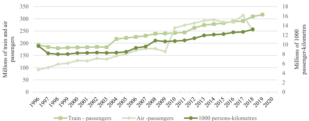
Figure 2 – Austrian transport performance indicators between 1996–2020

Regarding passengers’ final destinations, there has been little change since 2000: most passengers travelled within Europe. Looking at the airports reached by aircraft departing from Austria, short-haul flights are the most common. Since 2000, an average of 94.3% of all airports served were in Europe. This was followed by more distant destinations such as Asia (3.3%), Africa (1.6%) and the Americas (0.8%). The enroute airports, i.e. those airports to which passengers handled in Austria fly directly, were located on average 88.1% in Europe, 7.2% in Asia, 2.5% in Africa and 2.2% in the Americas [30].